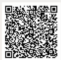
Scan QR Code

Huttons The Agency of Choice Call for Viewing +65-83889353